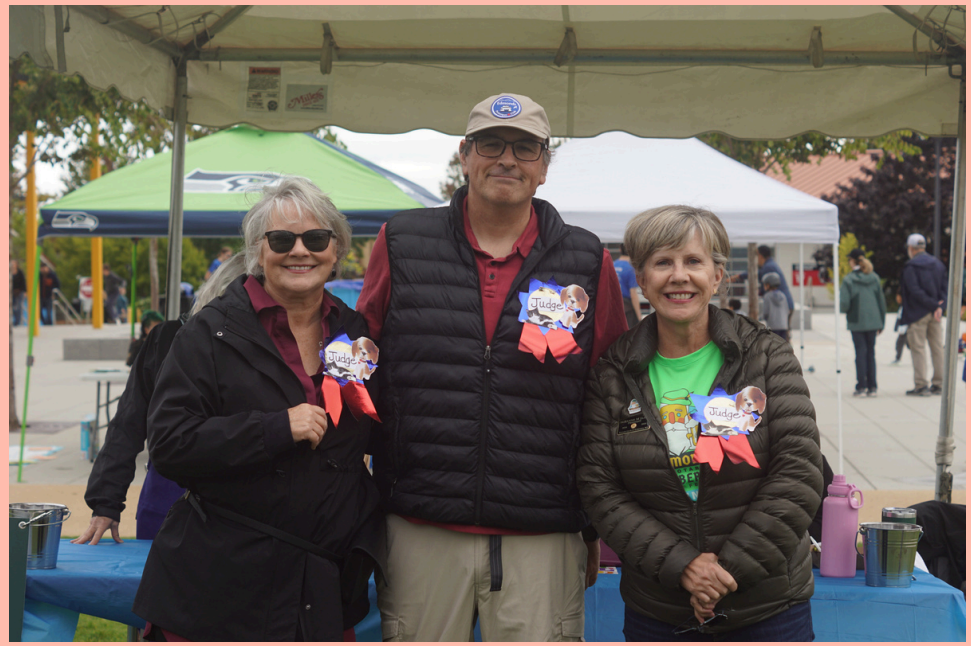
The Judges (it was a tough job)