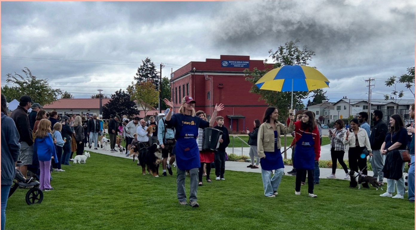
Under the dark and cloudy sky ...they're off